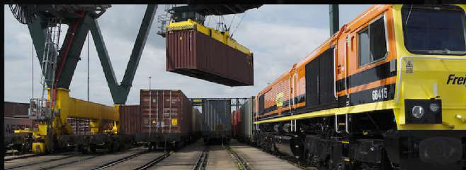
RAIL CARGO TRAIN